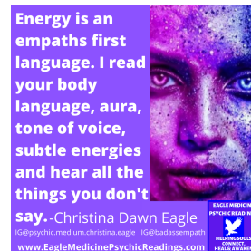
1:1 Empath Coaching